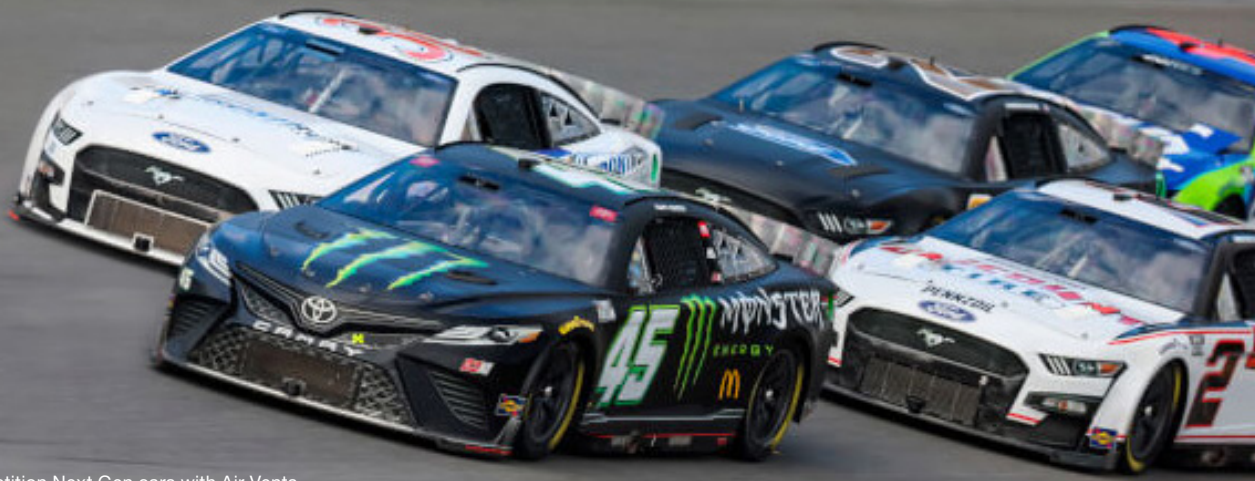
NASCAR Competition Next Gen cars with Air Vents